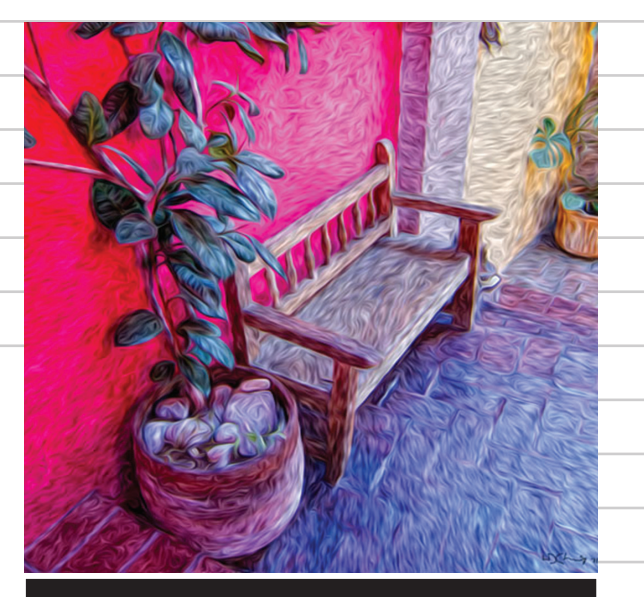
Larry Chait (6) / Honorable Mention