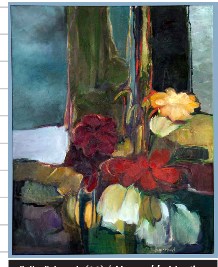
Sally Schouch (38) / Honorable Mention